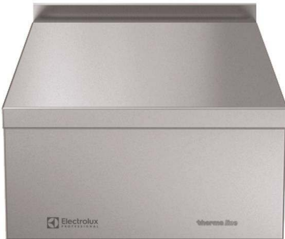
588564 (MBNABBEOOO) Closed Work Top, one-side operated with backsplash